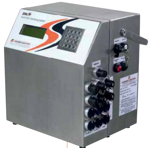
EPASS Unit with Integrated Electronic Sampler Controller

The system offers a high autonomy degree and permits to save precious human resources which can be employed in much worthy activities during the sampling operations.