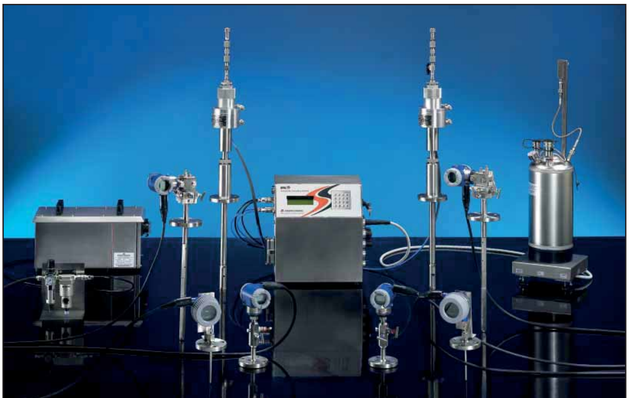
2 lines EPASS Unit fully connected with: Air filter, PS55-RA Sampling probes, Pitot Type Flow Meter, Pressure Transmitter, Temperature Transmitter, Battery Unit and weighing system.